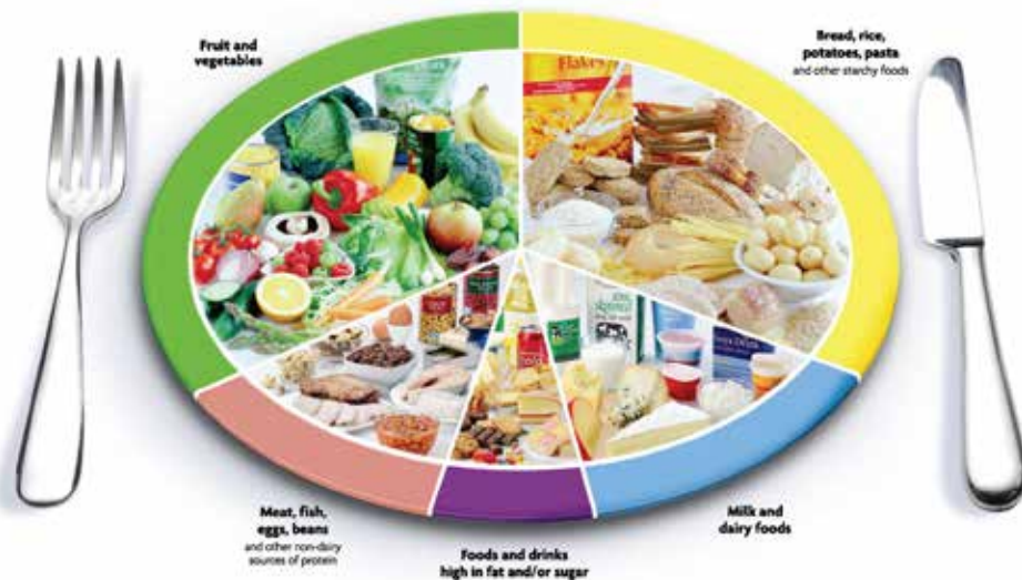
Crown copyright. Public Health England in association with the Welsh government, the Scottish government and the Food Standards Agency in Northern Ireland